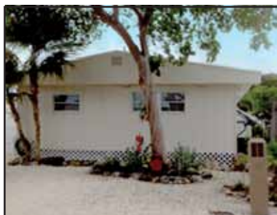
BEAUTIFUL MOBILE HOME ON A CANAL Well maintained, decorator perfect, great for full time or weekending. You won't find one nicer!! OWNER SAYS SELL!!

www.creeksidetiki.com www.facebook.com/creeksidetiki