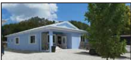
TWO 3/2 NEW GROUND LEVEL HOMES YOU choose which one you want - one done one near completion - nice homeowners' park. Lots of upgrades and custom features.