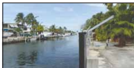
CANALFRONT IN TROPICAL ATLANTIC SHORES - STRAIGHT OUT TO THE OCEANFRONT. Updated kitchen. 2 bdrm up and an apartment down, plus workshop. Porches on street side and canal side. Concrete roof. Beautifully landscaped. Fenced. Very close to schools... TAVERNIER