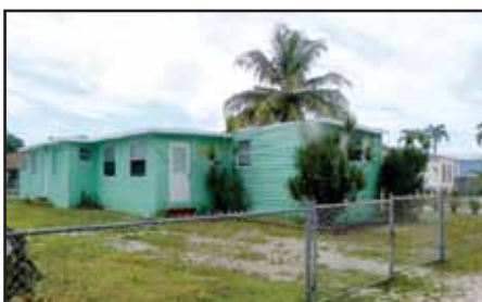
OWNER FINANCING - CANAL FRONT MOBILE Fenced - updated - plenty of room for parking