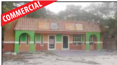
DRASTIC PRICE REDUCTION - 2 LEGAL SIDES IDEAL KEY LARGO LOCATION - GOOD VISIBILITY GOOD HIGHWAY FRONTAGE - MUST SELL NOW!!