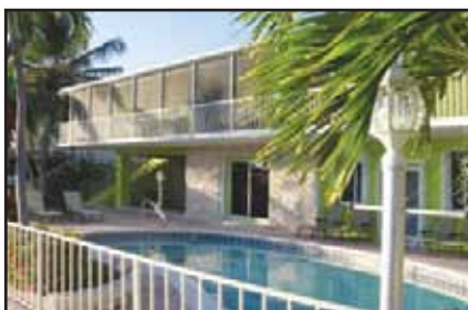
OWN YOUR OWN KEYS POOL HOME THIS SUMMER! Several great pool homes to choose from. Great for family fun and entertaining. Call to make an appointment