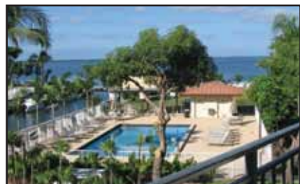
DRASTIC PRICE REDUCTION ON TAMARIND BAY UNIT 2/2 with bay views, and nice upgrades. Must sell NOW - good rental history.

www.creeksidetiki.com www.facebook.com/creeksidetiki