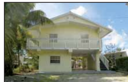
CANAL FRONT KEY LARGO HOME. Direct access to the bay. 2 bedrooms up. Workshop and storage down. $489,000.

We have cash investment buyers looking for properties in Key Largo... ready to buy!