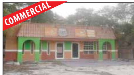
COMMERCIAL DRASTIC PRICE REDUCTION - 2 LEGAL SIDES IDEAL KEY LARGO LOCATION - GOOD VISIBILITY GOOD HIGHWAY FRONTAGE - MUST SELL NOW!!