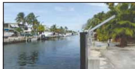
CANALFRONT IN TROPICAL ATLANTIC SHORES - STRAIGHT OUT TO THE OCEANFRONT. Updated kitchen. 2 bdrm up and an apartment down, plus workshop. Porches on street side and canal side. Concrete roof. Beautifully landscaped. Fenced. Very close to schools... TAVERNIER