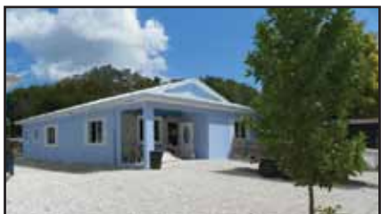
TWO 3/2 NEW GROUND LEVEL HOMES YOU choose which one you want - one done one near completion - nice homeowners' park. Lots of upgrades and custom features.