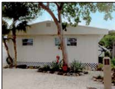
BEAUTIFUL MOBILE HOME ON A CANAL Well maintained, decorator perfect, great for full time or weekending. You won't find one nicer!! OWNER SAYS SELL!!