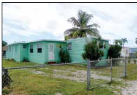
OWNER FINANCING - CANAL FRONT MOBILE Fenced - updated - plenty of room for parking