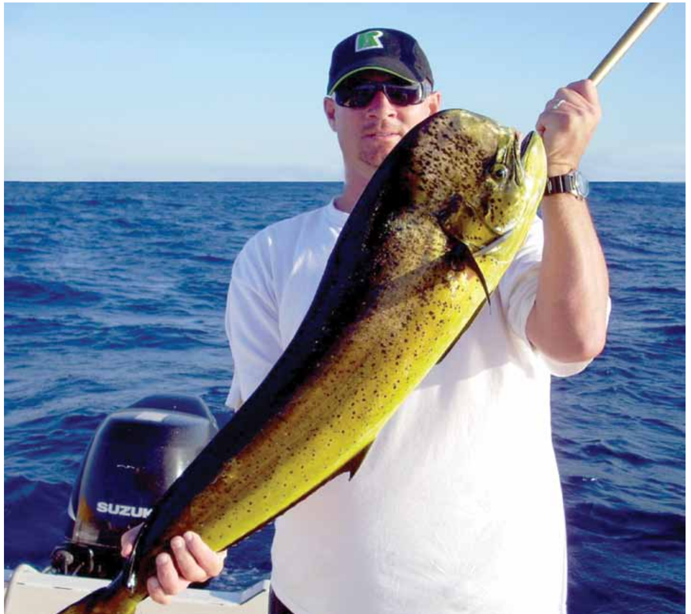
Let the tournaments begin! Check out page 8 for two SeaHunter™ tournaments coming up: Sailfish in April and Dolphin in May!

Coco-Nut Funnies Mangrove Galley Conch Characters Business in the Keys Anny Bannanny