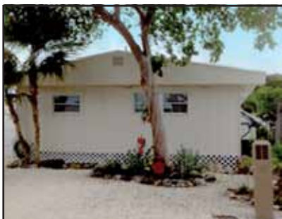
BEAUTIFUL MOBILE HOME ON A CANAL Well maintained,decorator perfect, great for full time or weekending. You won't find one nicer!! OWNER SAYS SELL!!