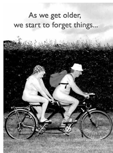
As we get older, we start to forget things...

Doctor - "How long have you had this problem?" Patient - "What problem?"