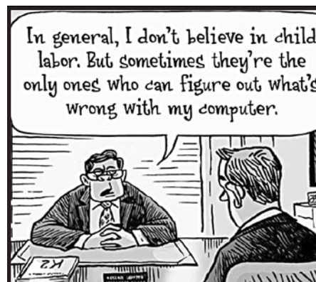
In general, I don't believe in child labor. But sometimes they're the only ones who can figure out what's wrong with my computer.