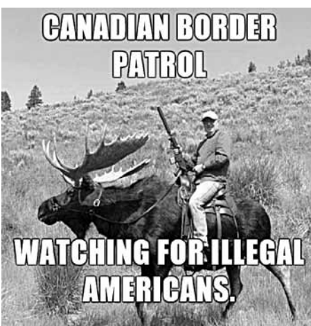
WATCHING FOR ILLEGAL AMERICANS.