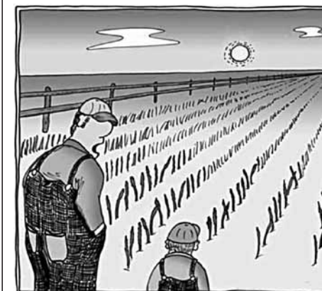
"You know, son, this is the dawn of the Age of Asparagus. Age of Asparaguuuus, Asparaguuuuuuus, Aspa...ra...guuuus."