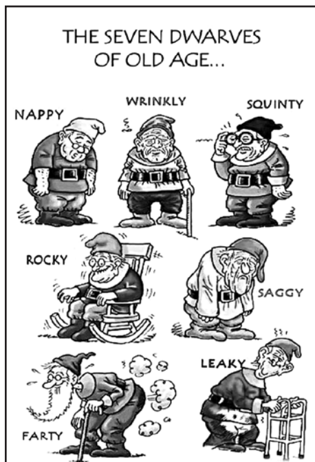
THE SEVEN DWARVES OF OLD AGE...