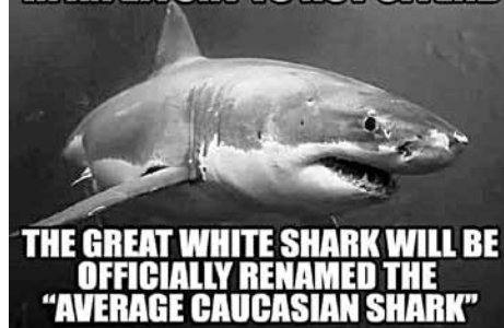
THE GREAT WHITE SHARK WILL BE OFFICIALLY RENAMED THE "AVERAGE CAUCASIAN SHARK"