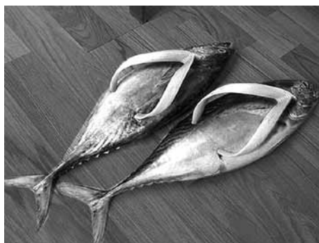
Sale on Key Largo flip flops - get 'em while they're fresh!