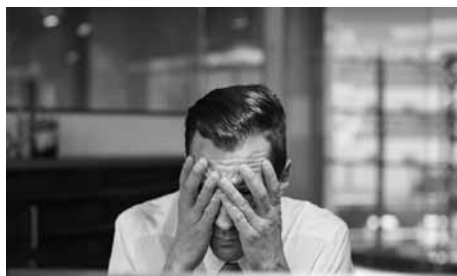
Sorry, but your password must contain an uppercase letter, a number, a haiku, a gang sign, a hieroglyph, and the blood of a virgin.

The Irishman handed his drink back to the attendant and said, "Me, too. I didn't know we had a choice."