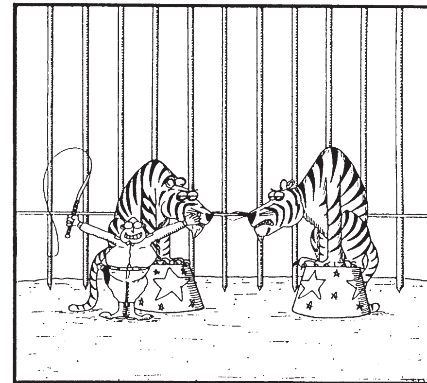
"I think it's time we saved a little face here, Fred..."