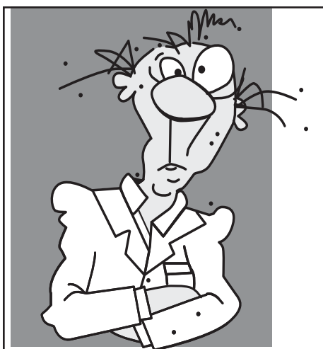
Scientists says the world is made up of Protons, Neutrons and Electrons. They forgot to mention Morons.

Sometimes I turn to God; sometimes I turn to Vodka. Either way I am being guided by a spirit.