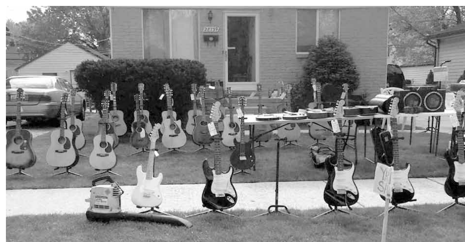
Wonder what he did... to make her do this?

IS IT WRONG TO DROP DRUNKS OFF AT HOUSES THAT AREN'T THEIRS?