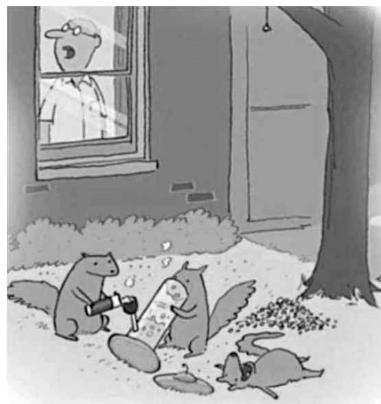
"The squirrels are messing with your bird feeder."

If your cup is half full, you probably need a different size bra!