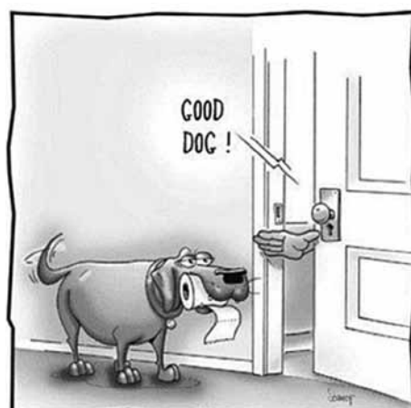
PERHAPS THE MOST NOBLE OF ALL RESCUE ANIMALS: THE LAVATORY RETRIEVER

I'm so sick and tired of my friends who can not handle their alcohol. Last night they dropped me 3 times while carrying me to the car.