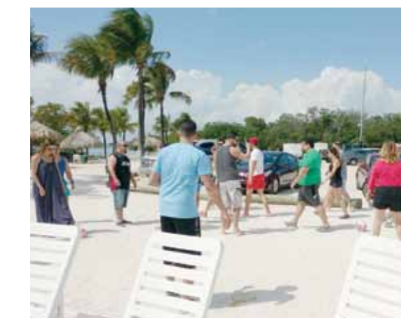
The Bank of Boston employees enjoy a team-building day at Gilbert's Resort.