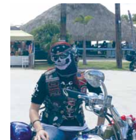
Sway from Homestead, wearing her great face protector at Gilberts in March.