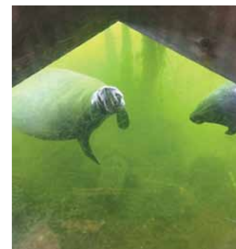
Curious manatees visit the Pilot House Glassbottom™ Bar.