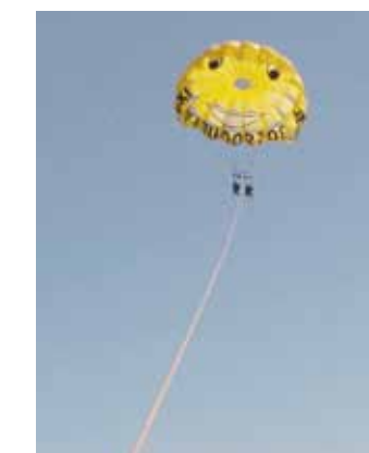
Keys Adventure Watersports is the only way to fly in Key Largo!