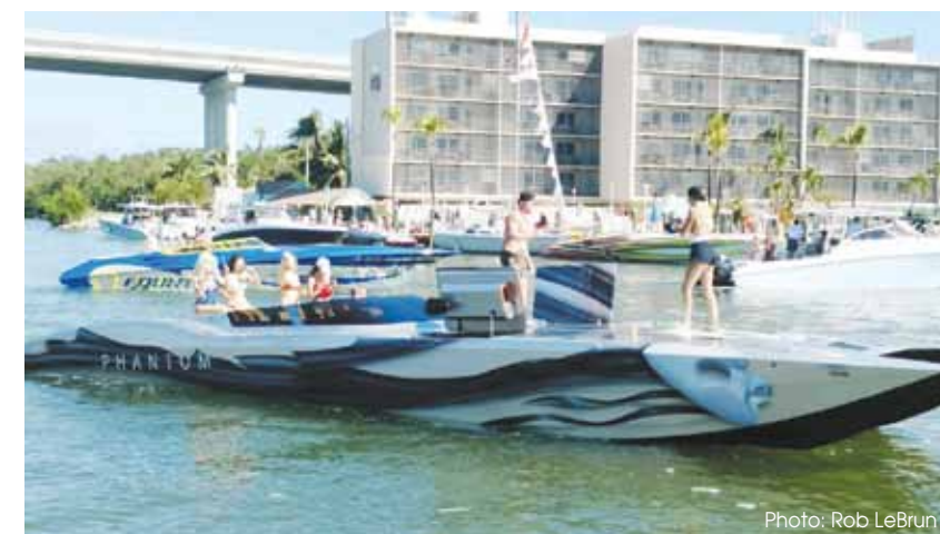
The Florida Powerboat Club stopped by Gilbert's for lunch during their November Poker Run. See them again in February.