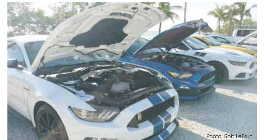
The Mustang Car Club showed off American Muscle at Gilbert's.