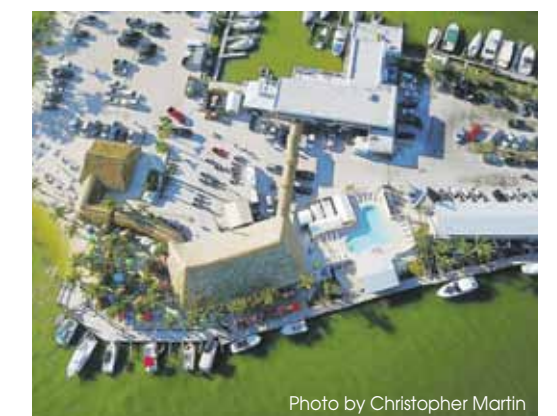
20 days after Hurricane Irma, Gilbert's reopened better than ever.