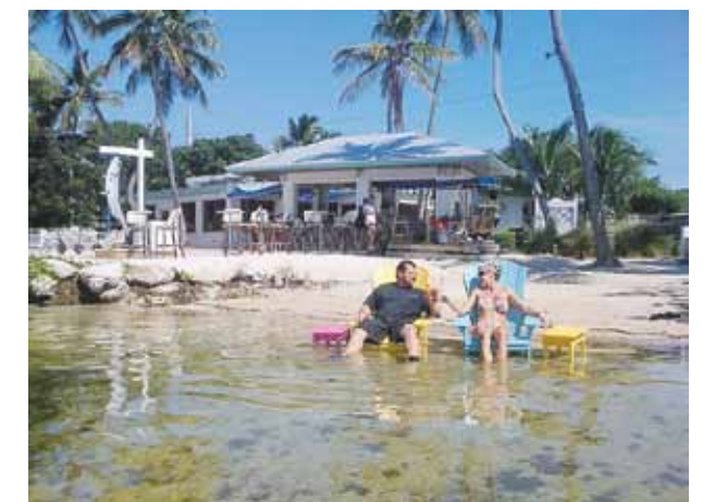
Soak up the sun at Marker 88 Restaurant while enjoying a Piña Coloda with your feet in the water