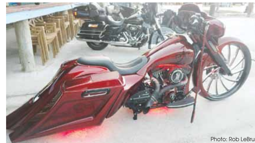
There are some spectacular bikes on display at Gilbert's every weekend.