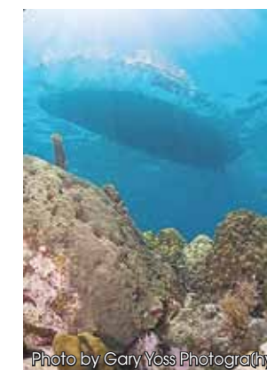
Keys Diver underwater photo.