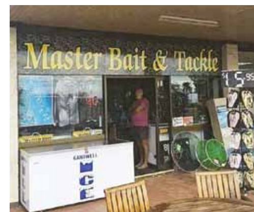
Just what Key Largo needed... another tackle shop!