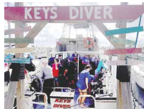
Best diving in the Keys!