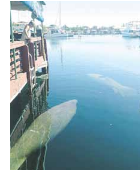
Manatees at the Pilot House.