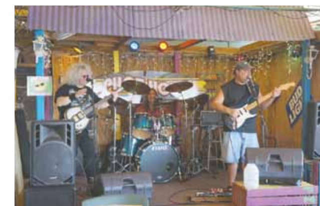
Alter Ego entertains at the Pilot House.