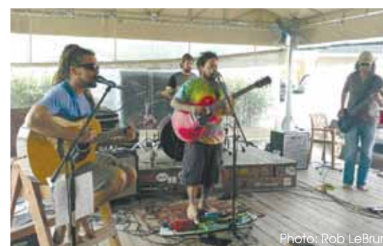
The Stone Crabs of Marathon sing "Rodeo Clowns" at Gilbert's Resort.