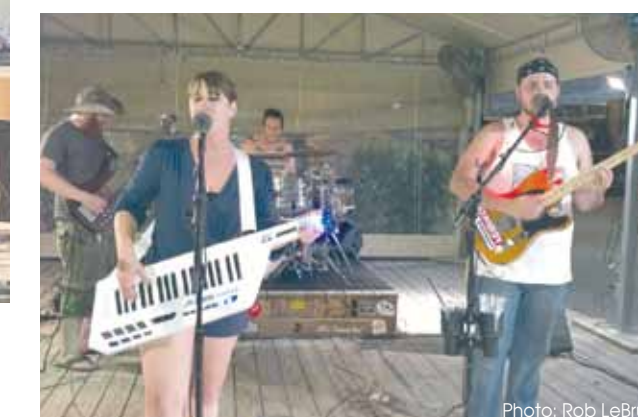
YouTube sensation Osiella performs at Gilbert's Resort during their 2017 Nationwide Tour.