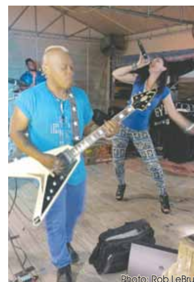
The Gypsy Lane Band features two original members of The Village People. See them at again Gilbert's this fall.