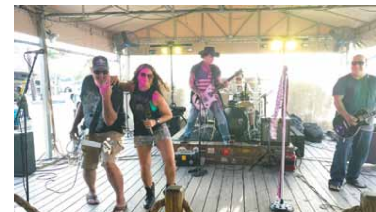
The MainStreet Band rocked the Gilbert's Resort crowd in May.