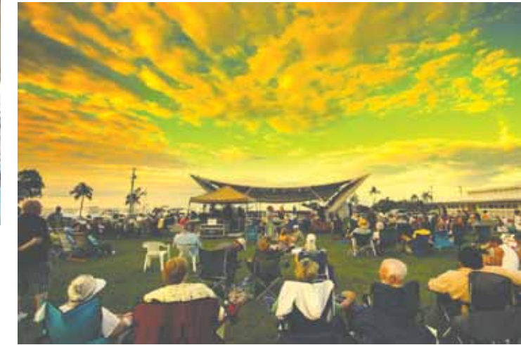
Bayjam - wow!