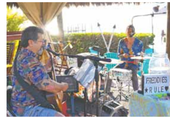
The Freddie's Rule at Snooks.