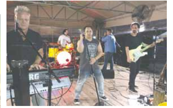
Stall 4 from Delray rocked the house at Gilbert's. See them again in July.