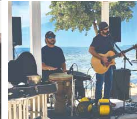
Stereo Underground at Marker 88.