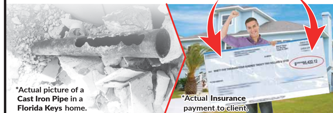
*Actual picture of a Cast Iron Pipe in a Florida Keys home.