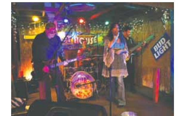
Taylor King Band at the Pilot House.