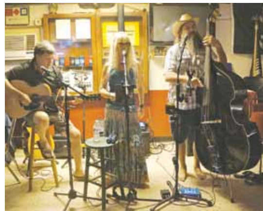
Sweetwater at the VFW.