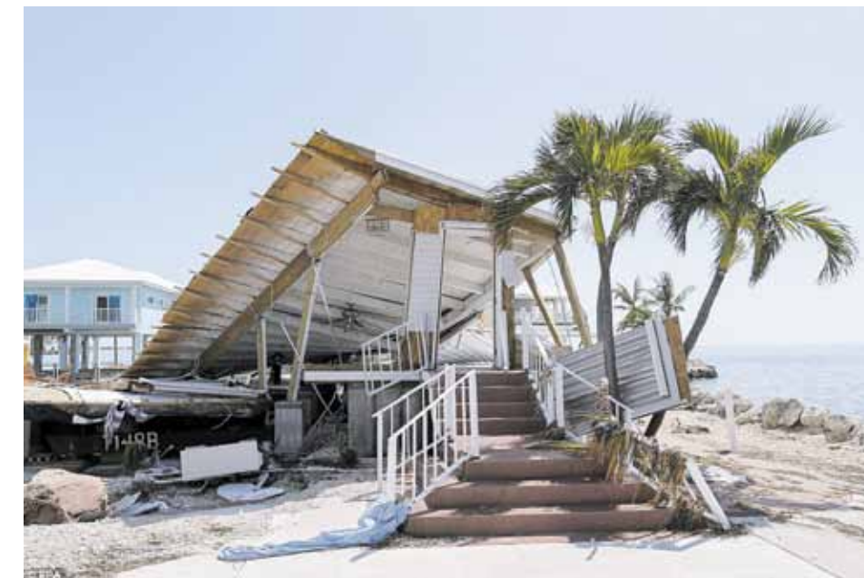
It must have been a shock when the owners of this Marathon home returned.

I saw people standing by what used to be their homes and crying, or just staring in shock. There are so many things that run through your head all at once. Where do we go from here? I lost my job; where am I going to find another? Where are we going to live? Will I ever see my friends again? Will my insurance cover all this? Do we even have insurance?