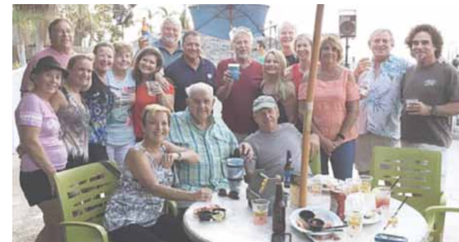
Friends gather at the Big Chill post-Irma.