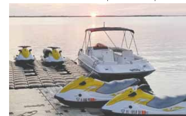
Keys Adventure Watersports is open at the Big Chill.