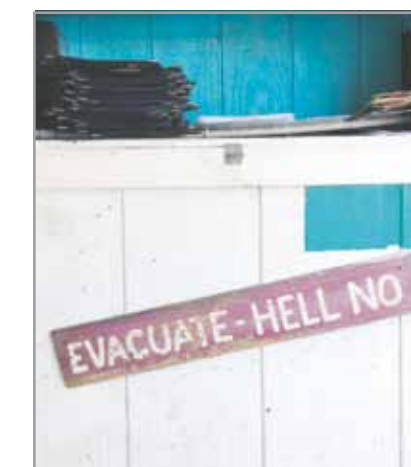
Sharkey's showing that Conch Strong spirit!