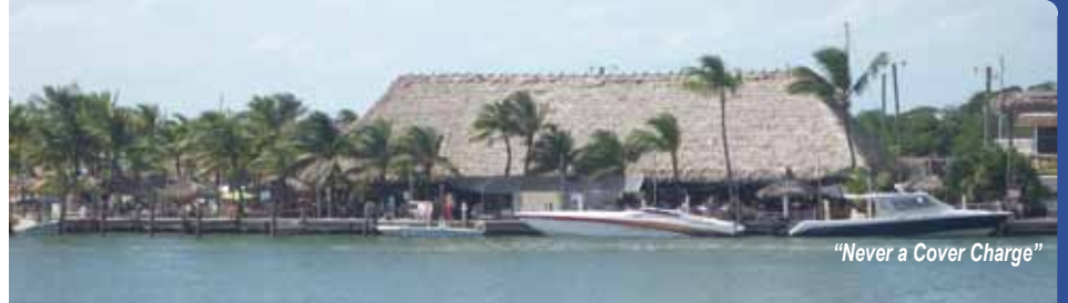
"Never a Cover Charge"

Waterfront Tiki Bar, Restaurant, Motel & Marina