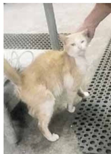
Gumby the Legion cat.