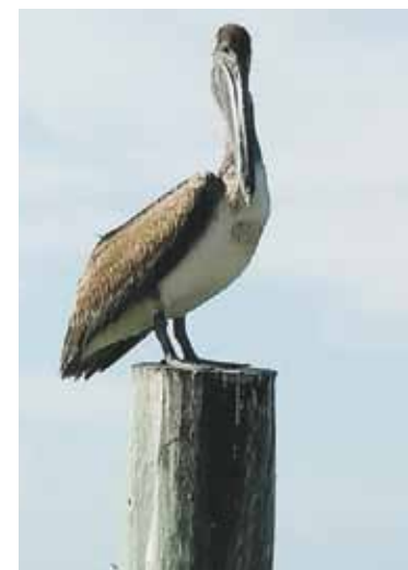
Looking for a Gilbert's lunch!