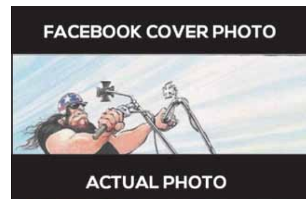
FACEBOOK COVER PHOTO