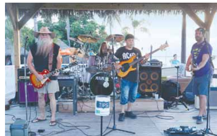
With Uncle Smokey