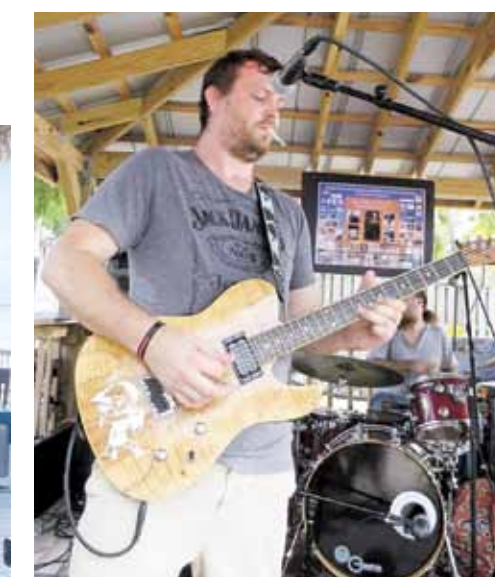
With Uncle Rico