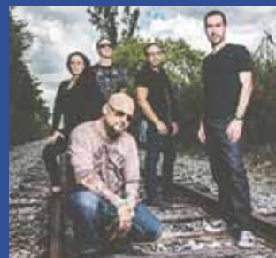
3RG MIAMI Sun. Feb. 4, 1-6pm