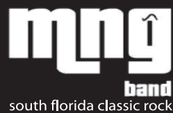
MR. NICE GUY Sunday, Feb. 11 1-6 pm