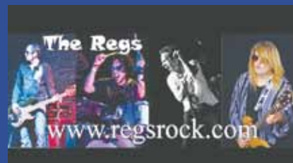
THE REGS Sunday, Feb. 25 1-6pm