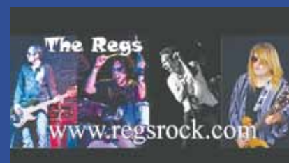
THE REGS Sunday, Jan. 28 1-6pm