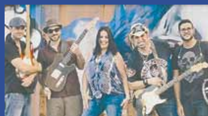
THE DROPOUTS Sunday, Jan. 14 1-6 pm