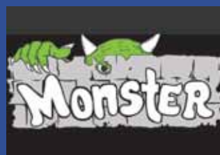
MONSTER Sunday, Jan. 21 1-6pm