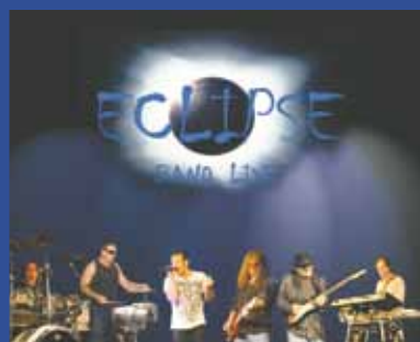
ECLIPSE Sunday, Jan. 7, 1-6pm