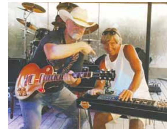
The Coconut Cowboys ham it up for the camera. Catch them again on August 4th at Gilbert's Resort.