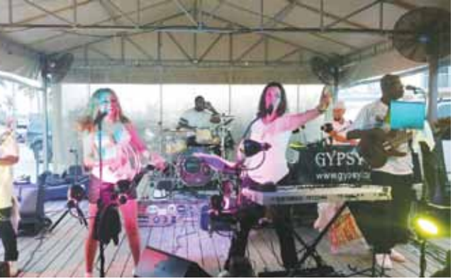
Gypsy Lane rocked the Gilbert's stage in June. See them again this fall!