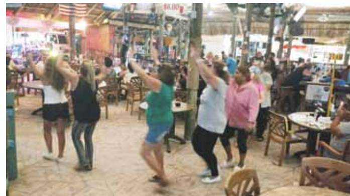
You never know when a Conga line will break out at Gilbert's Resort.