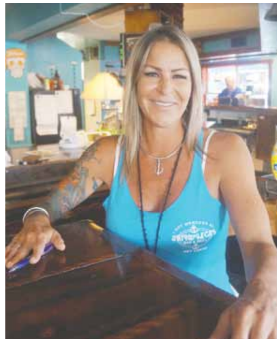
Greetings from Tiffany at Shipwrecks.