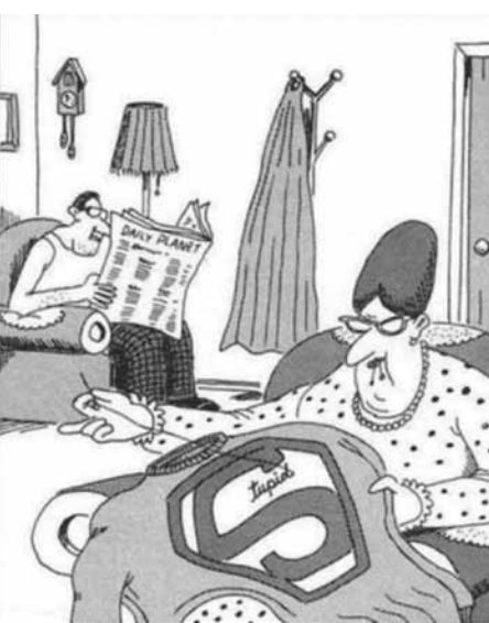
After many years of marital bliss, tension enters the Kent household.