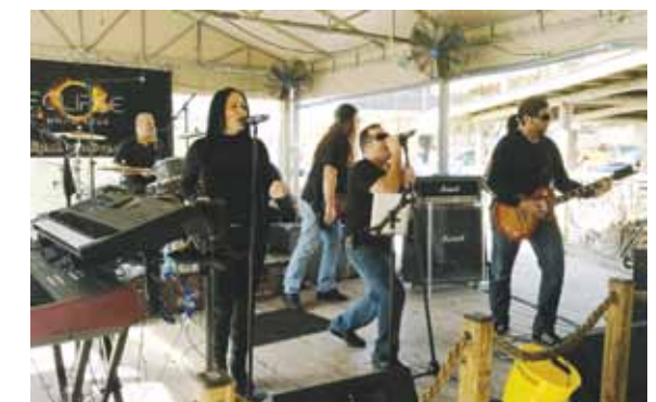
Eclipse rocked the stage at Gilbert's in December. See them again on March 11th.