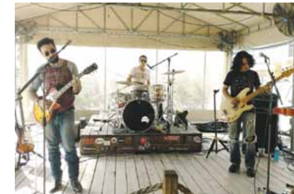
The Miami band Brothers of Others always bring a great show to Gilbert's.