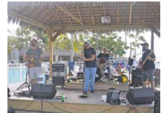
Sunday Funday Band at the Big Chill.