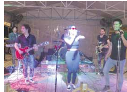
The Tight Band from Miami made their Gilbert's debut last month and rocked the place!