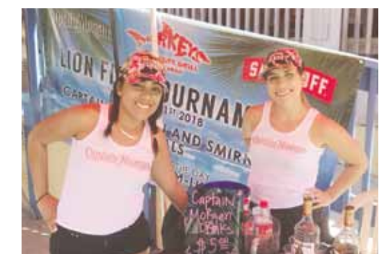
Captain Morgan babes at Sharkey's Lionfish tournament.