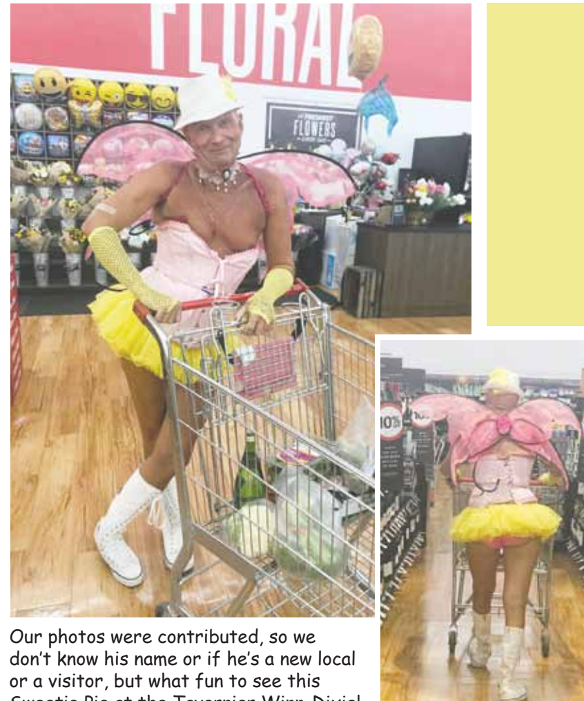
Our photos were contributed, so we don't know his name or if he's a new local or a visitor, but what fun to see this Sweetie Pie at the Tavernier Winn-Dixie!

Your Mother is always with you. She's the whisper of the leaves as you walk down the street, She's the smell of certain foods you remember, flowers you pick, the fragrance of life itself. She's the cool hand on your brow when you're not feeling well, she's your breath in the air on a cold winter's day. She is the sound of the rain that lulls you to sleep, the colors of a rainbow, she is Christmas morning. Your mother lives inside your laughter. She's the place you came from, your first home, and she's the map you follow with every step you take. She's your first love, your first friend, and your first enemy, but nothing on earth can separate you. Not time, not space... not even death.