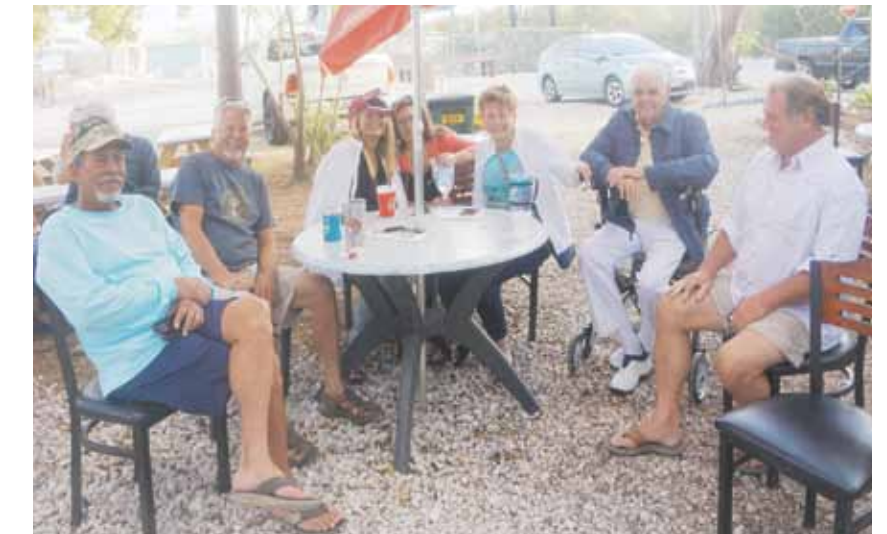
Always a party at the American Legion.