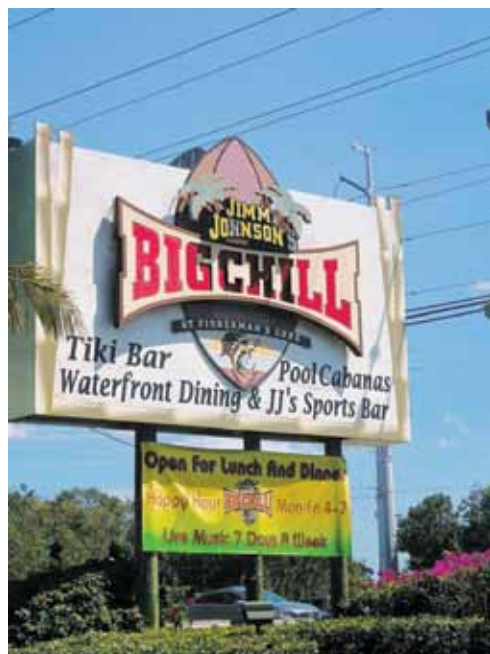
Big Chill: Happy 11-year anniversary!