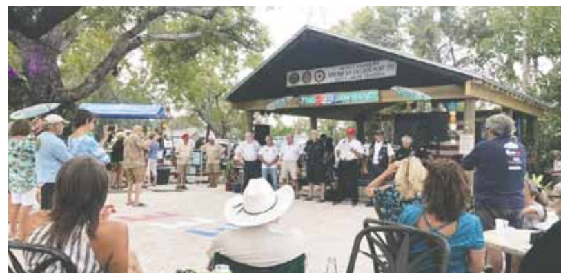
Centennial celebration at the American Legion.