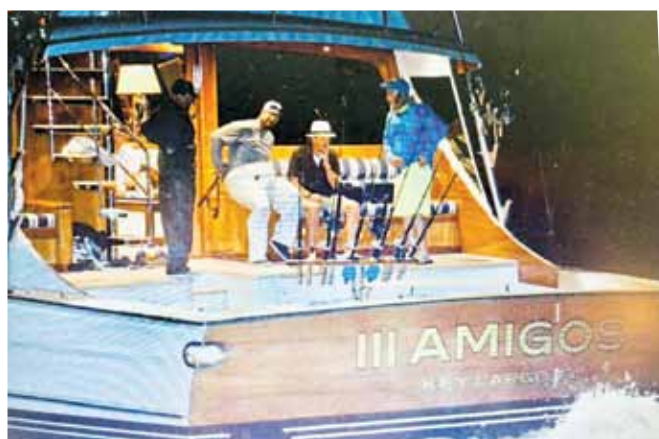
Kid Rock Fishing on III Amigos in Jimmy Johnson's Fishing Championship.