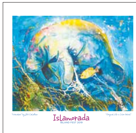
Original Living in Color Artist ©Jen Callahan is the poster artist for the 28th annual Island Fest.

Presented by the Islamorada Chamber of Commerce, the two-day festival will offer live music, gourmet cuisine, vintage cars, and plenty of fine art and craft. The festival takes place on Saturday and Sunday, April 6 & 7, at Founders Park on the beach.