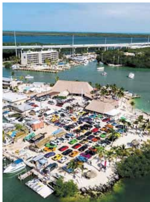
Lamborghini Day at Gilbert's Resort.