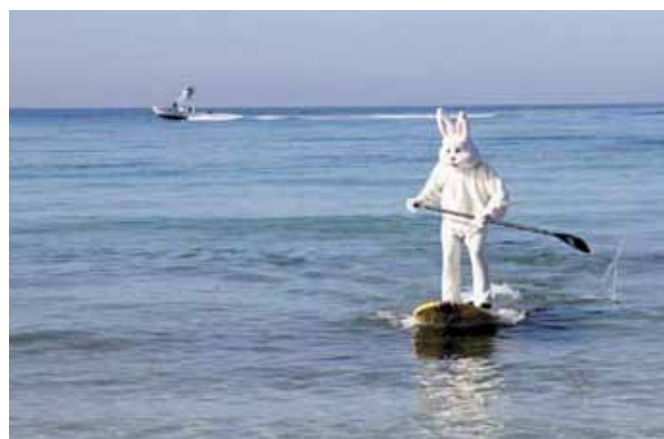
Look who's getting in on the SUP action!