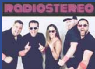
RADIOSTEREO Sunday, August 4 1-6 pm