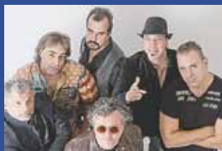
TRIP MACHINE Sunday, August 11 1-6 pm