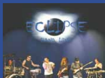
ECLIPSE Sunday, August 18 1-6 pm