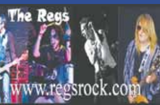
THE REGS Sunday, August 25 1-6 pm