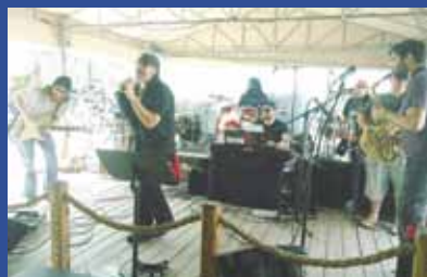
APACHE DRAGON Sunday, Feb. 10 1-6pm