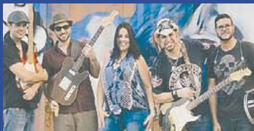
THE DROPOUTS Sunday, Feb. 3, 1-6 pm