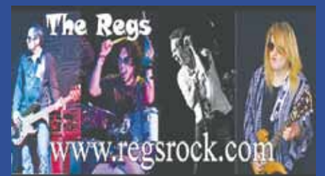
THE REGS Sunday, Feb. 24 1-6pm