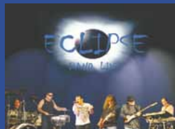
ECLIPSE Sunday, Feb. 17 1-6pm