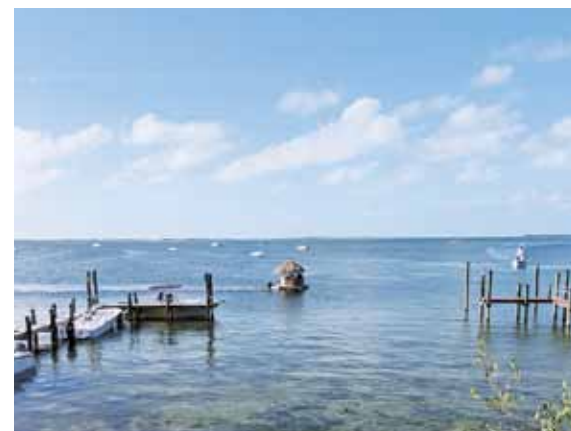
Lovely day for lunch at Bayside Grille.