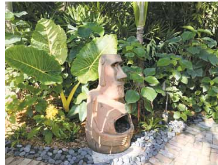
ORCHID COTTAGE is a Victorian cottage with tall palms, lush greens and abundant orchids. A storybook evocation with whimsical twists is tucked into a natural hammock.