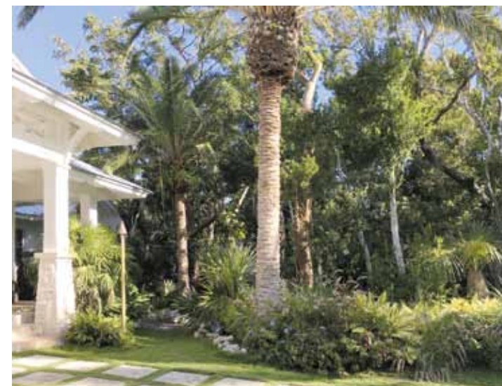
INDIAN MOUND ESTATE is a four acre bayside hammock parcel pierced by a winding granite drive revealing a stunning architectural assemblage. Three structures, main house, guest house, and garage studio all sit respectful of the native trees and land in harmony with a flowing shoreline complete with soil conserving buttonwoods.