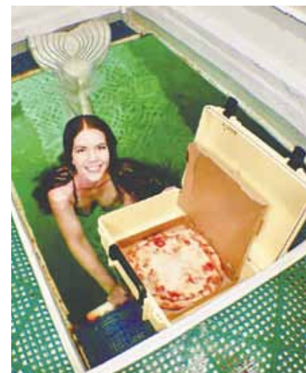
Jules Undersea Lodge mermaid pizza delivery. Hope it's Enrico's pizza from the Big Chill!