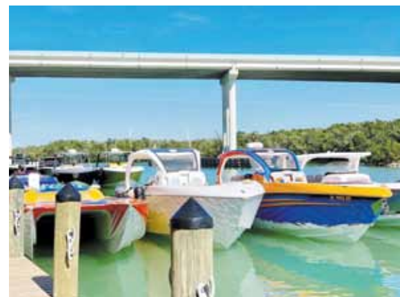
The power boats visited Gilbert's recently.