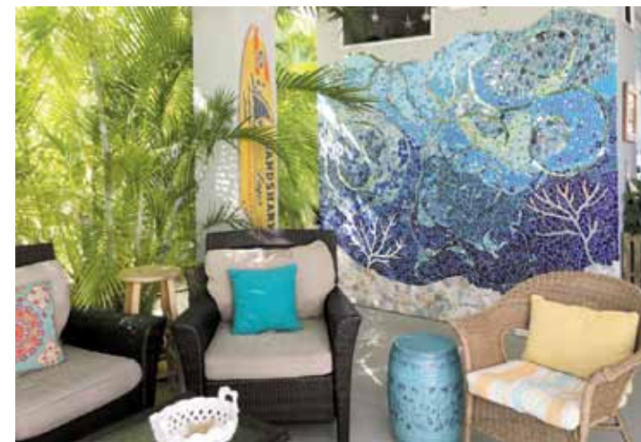
BIG PALM features a pair of majestic Bismarck Palms welcoming the viewer to a relaxing colorful entertainment paradise. Kidney shaped pool shielded by silver buttonwoods, seldom seen yellow ixora hedge, and shimmering glass wall mural all combine to invite one to while away the time.