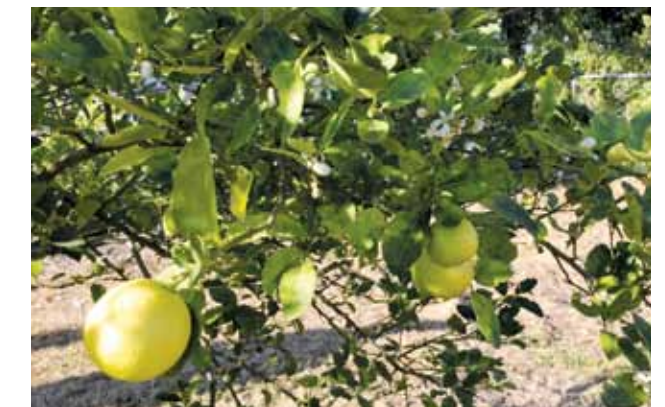
LIVING HISTORY GROVE: A modern-day farmer has returned the use of land to the agricultural mode. Local historians report this area was used in the 1880's by pioneer farmers. Fifty producing Key lime trees along with dozens of pineapples will give the visitor a glimpse of how early pioneers were able to survive before the modern day grocer.