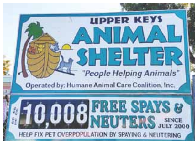
Congrats to our Upper Keys Animal Shelter on surpassing 10,000 free spays and neuters!