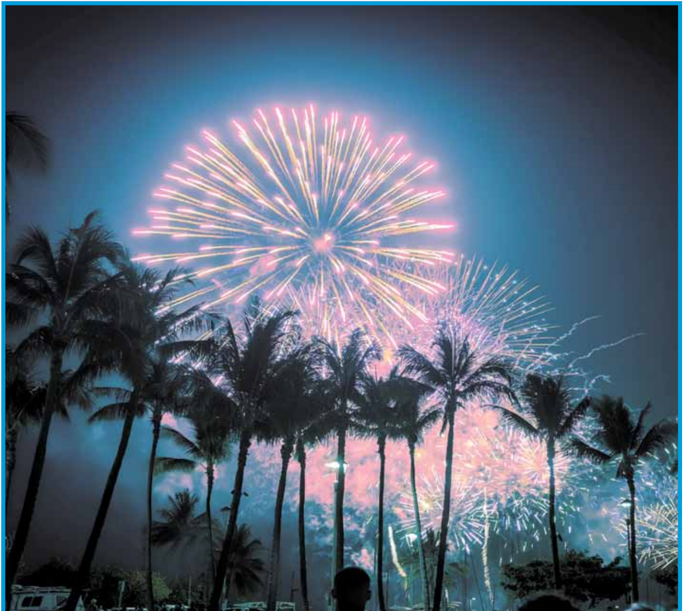
Fireworks for the Fourth - can't beat 'em! There are celebrations on Blackwater Sound in Key Largo and at Founders Park in Islamorada this year.