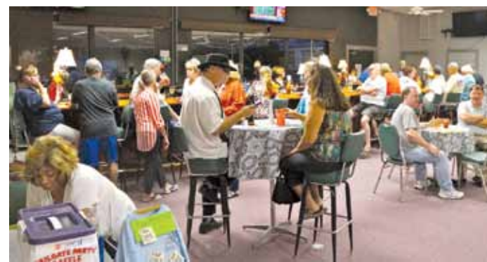
November 2014: A capacity crowd enjoying themselves at the Elks Lodge in Tavernier.