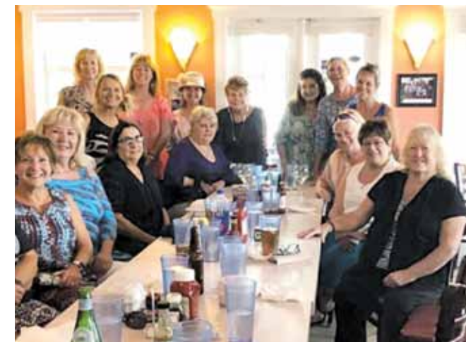
Local ladies lunch at the Conch House.