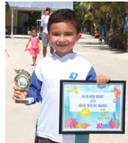
Great Angling Award!