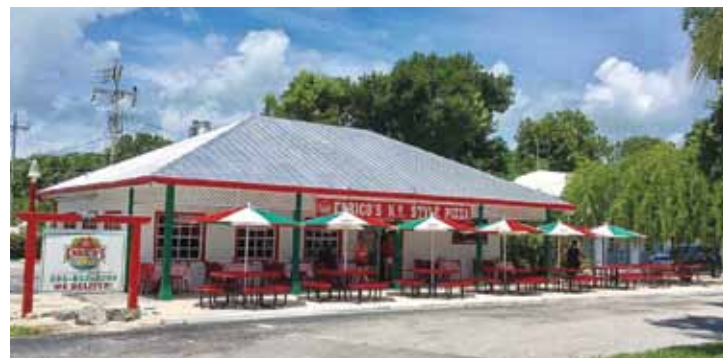
Best pizza in the Keys! ENRICO's is now open in Tavernier.