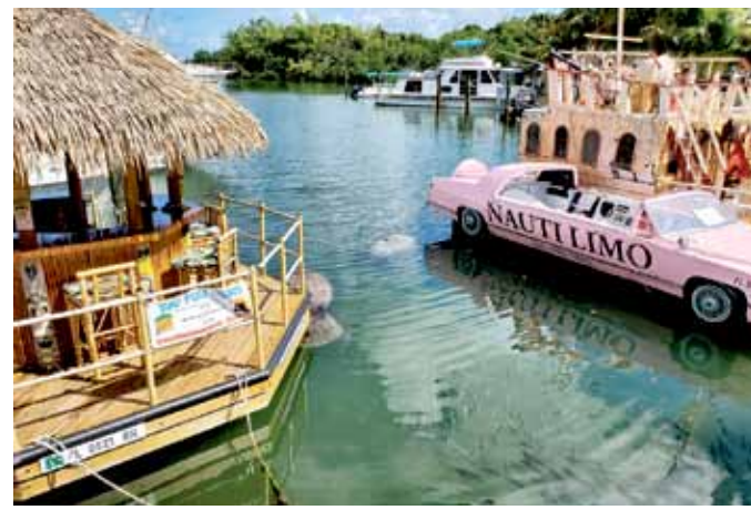
There are some interesting boating options available at The Lorelei.