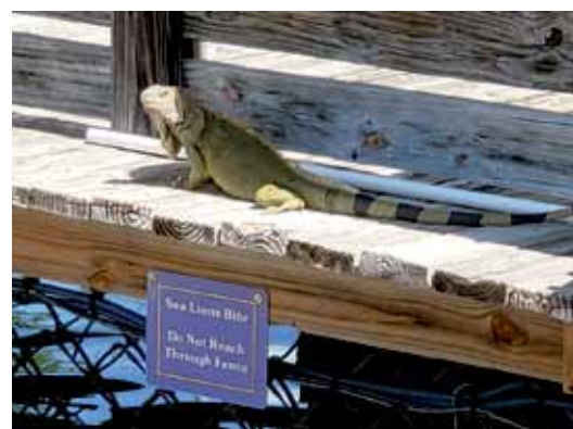
I wonder if sea lions snack on iguanas?