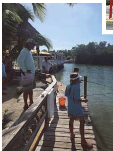
The Lorelei hosts the annual Kids Fishing Derby every September.