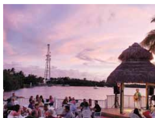
Just another stunning Lorelei sunset.