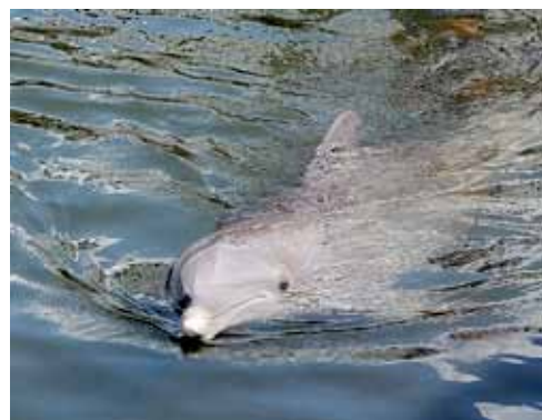
Dolphin Research Center has some amazing dolphins!