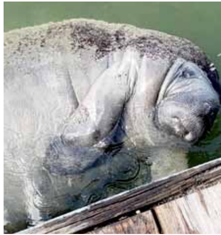
A friendly Manatee hangs out at the Lorelei.