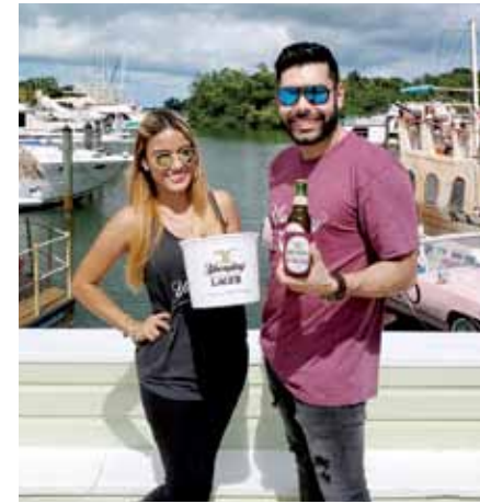
The Yuengling team gave away free beer and swag at The Lorelei during the Peterson's Poker Run.