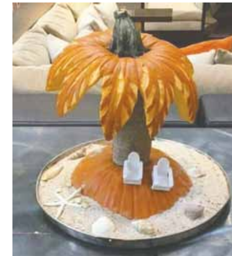
Pumpkin carving in the Keys.

An old lady with a cane was walking past a young man at a bus stop singing "21 today, 21 today". The young man says "you're not 21 you crazy old bat". She turns to him and with a mighty swing cracks him over his head with her cane and walks away singing "22 today, 22 today."