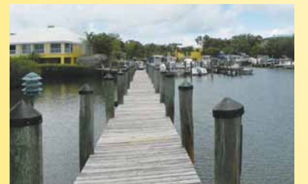
9824 Mariners Avenue is being sold with or without the boat slip. Without the boat slip, the price is $475,000.

3/2 Landings of Largo condo with all the bells and whistles plus a deeded boat slip with lift. Views everywhere. Walk across to the pool or very near to the Marina. A top location for Keys living. Weekend or full time, for you & your family.