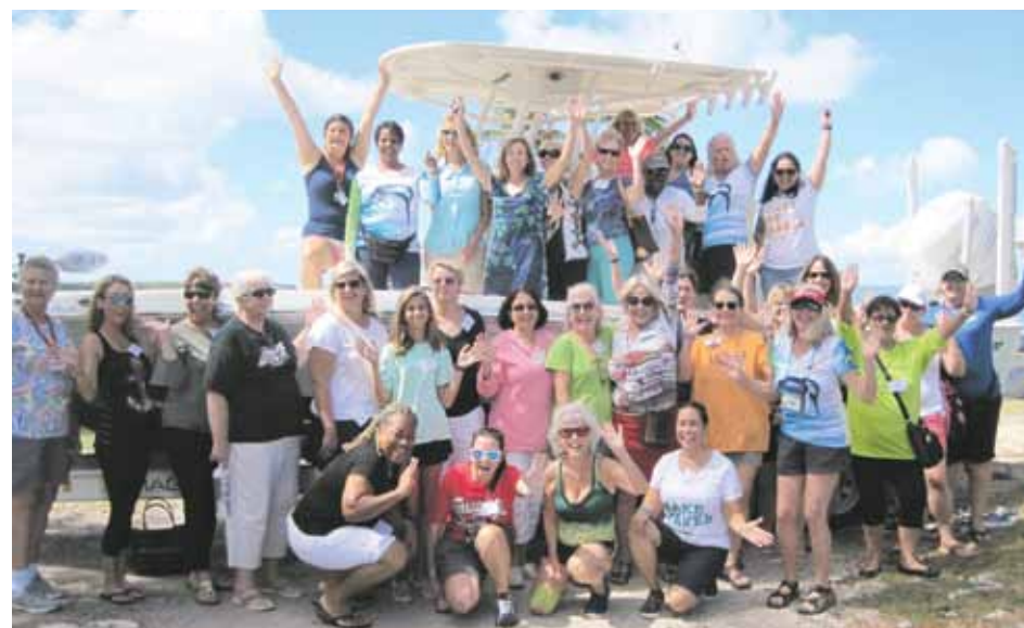
LLGF Isla 18 Class: Graduates of Ladies, Let's Go Fishing Keys 2018.

Activities launch Friday evening with a networking social and appetizer contest from 6:30 to 8:30 pm. Saturday morning indoor presentations begin at 9 am, covering Offshore, Inshore and