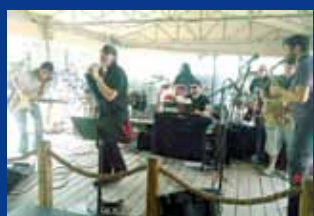
APACHE DRAGON Sunday, Jan. 5 1-6pm