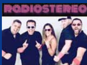
RADIOSTEREO Sunday, Jan. 19 1-6 pm