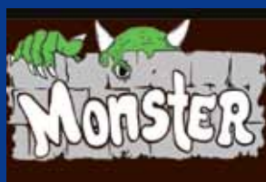
MONSTER Sunday, Jan. 12 1-6pm