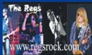
THE REGS Sunday, Jan. 26 1-6 pm