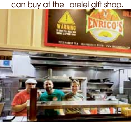
The crew at Enrico's in Islamorada.