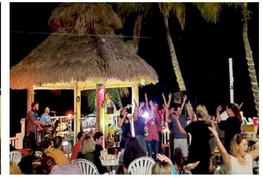
The Gypsy Lane band features two original members of The Village People, so of course they play that song at the Lorelei, to the delight of their fans!