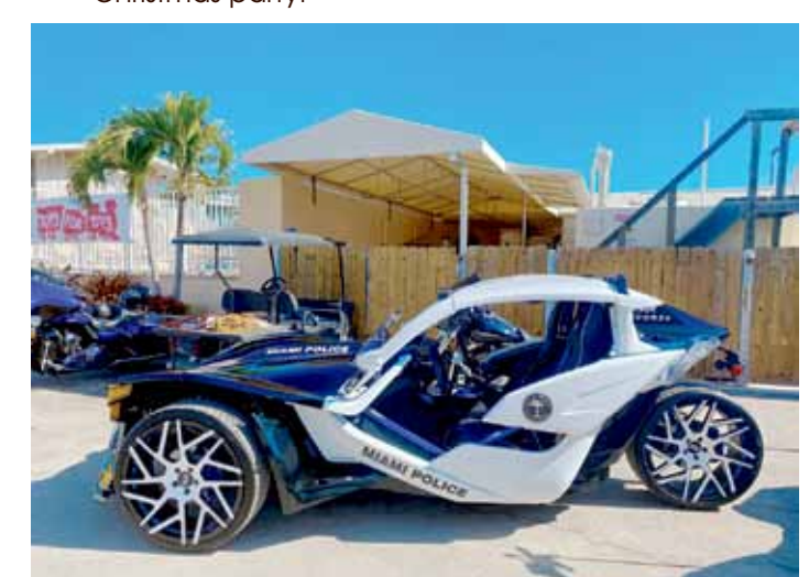
Annual Police Officer Assistance Trust Ride for Kids at Gilberts