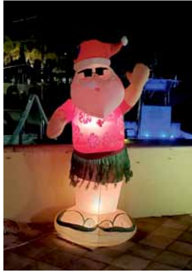
Santa greeted everyone coming