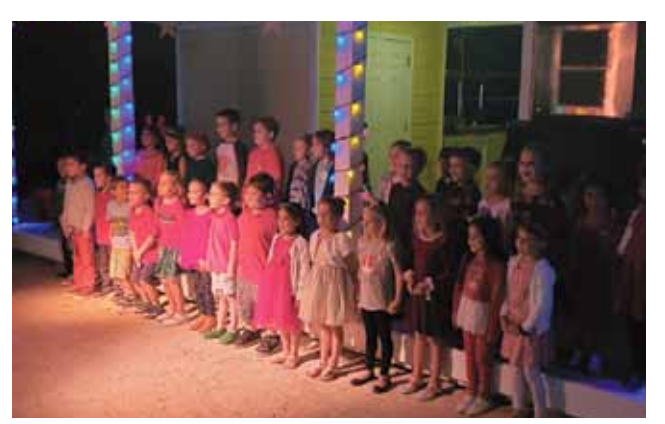
Recent Lorelei wedding - they can host The PKS children sang Christmas carols your wedding or rehearsal dinner; at the annual fundraiser held at the Lorelei in early December.