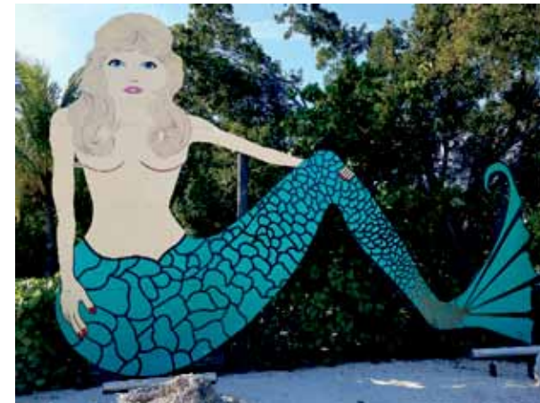
Before her makeover.