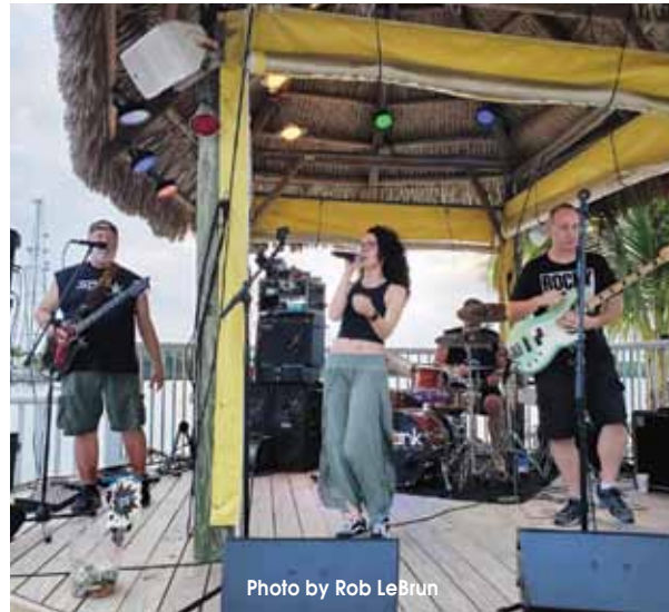
Spunk the Band will be performing a special "dueling female power singers" at their next Lorelei show on April 4th.