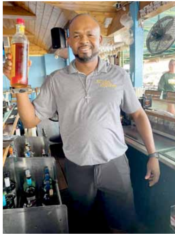
DJ at the Pilot House invites you to Fireball Friday - $4 shots.