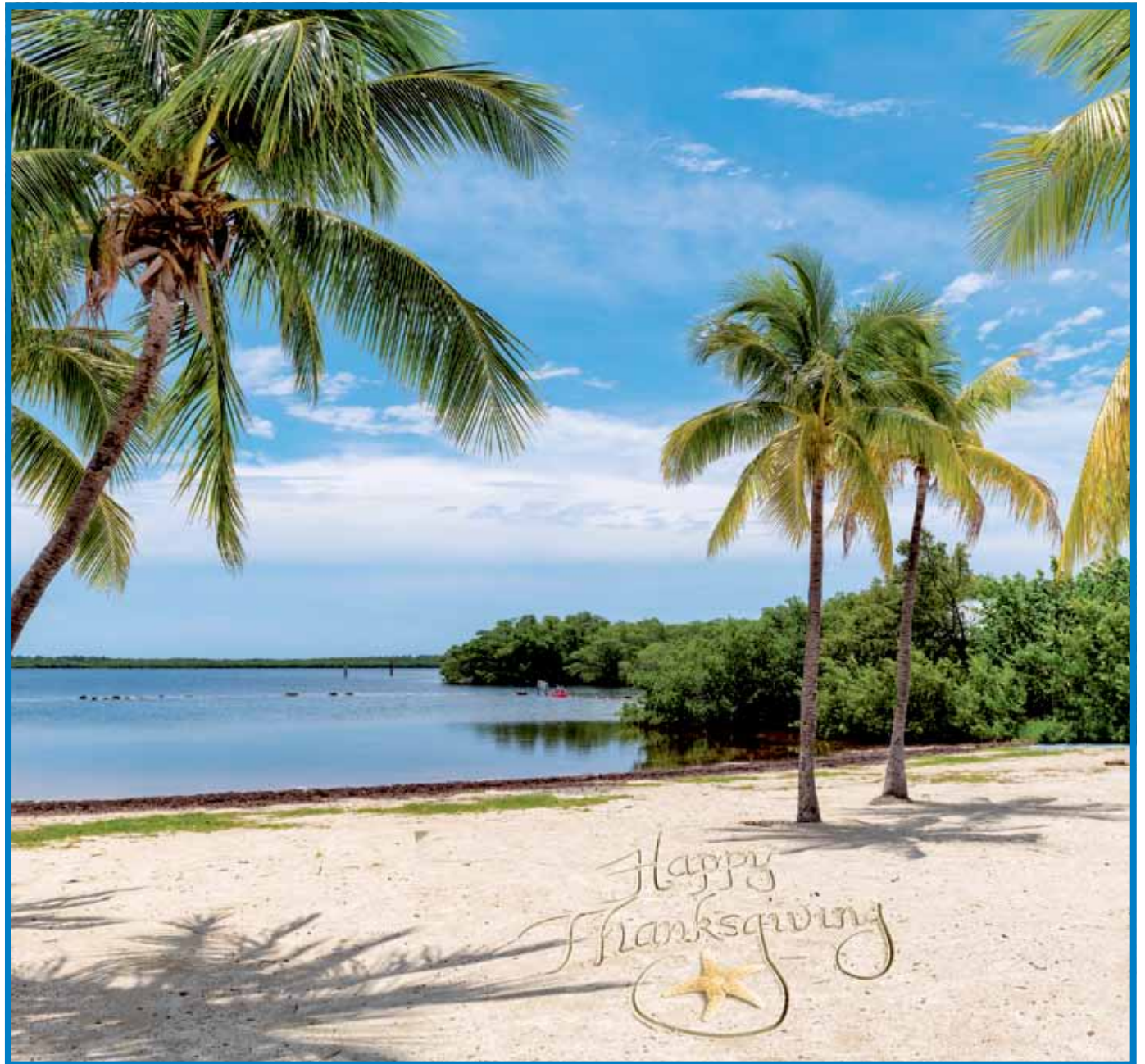
The beach at Pennekamp Park holds a festive message for Thanksgiving in paradise!

Coco-Nut Funnies Conch Characters Business in the Keys Classifieds