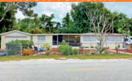
6 Rose Place

Spacious home on tropical corner lot! Open floor plan w/separate laundry room. Concrete garage & Addition. Located in a family community, close to schools, shopping, restaurants, & easy commute to Miami. $249,000