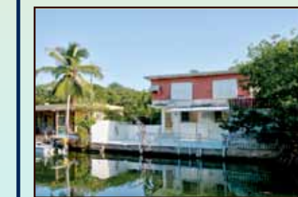
129 Pirates Drive

Opportunity is Knocking!!! Open the door! Keysey two-story concrete bayside canal home with direct bay access. Comes with 2 additional lots and endless possibilities! Art Deco appeal with old time Keys feel! For the Buyer with a creative flair!!! $769,000