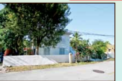
22 Bessie Road

Opportunity is Knocking!!! Open the door! Keysey two-story concrete bayside canal home with direct bay access. Comes with 2 additional lots and endless possibilities! Art Deco appeal with old time Keys feel! For the Buyer with a creative flair!!! $769,000