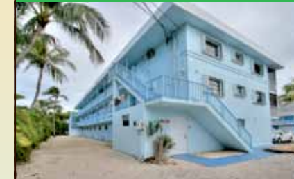
119 Cortez Drive G-1

Desirable Corner Unit! Leave your worries behind! Enjoy all the sea has to offer: Boating, swimming, fishing, and at the end of the day... relax with ocean breezes from your screened balcony. 1/1 Condo in friendly complex. Dockage available. $242,000