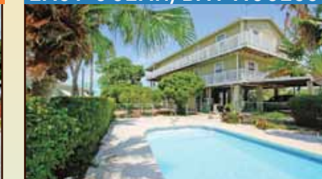
1642 Churchill Downs

Warm & Welcoming! Top floor 2B/1.5B w/splendid Bay Views. 2nd floor waiting for your personality and flair for a remodel. Endless possibilities on Bed/baths! concrete pool, 55' dock w/ramp on 1/3 acre of land! $995,000