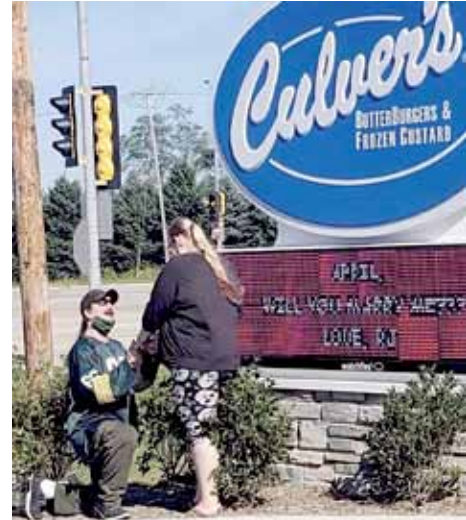
Someone's perfect proposal!