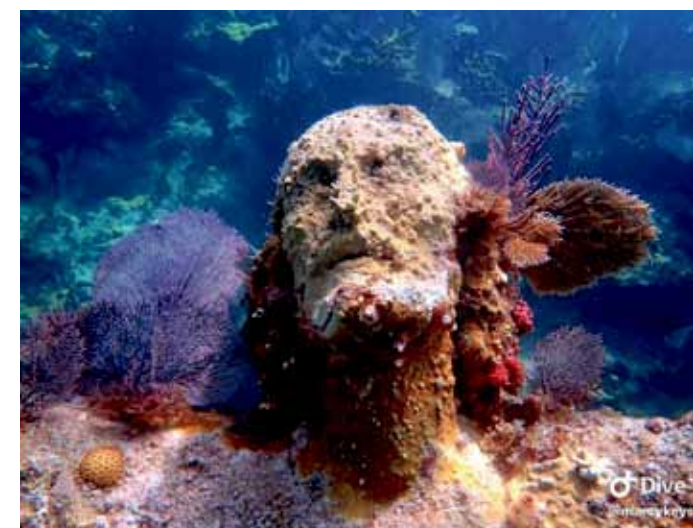
Christ of the Abyss.