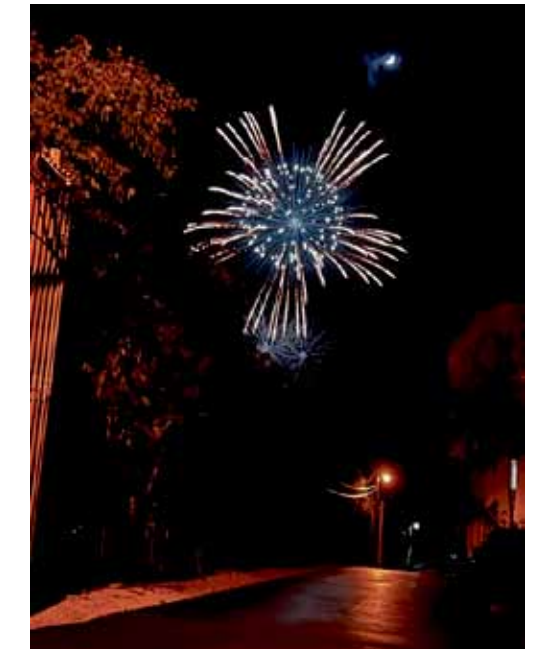
A perfect Key Largo firework photo at Tamarind Bay Club.