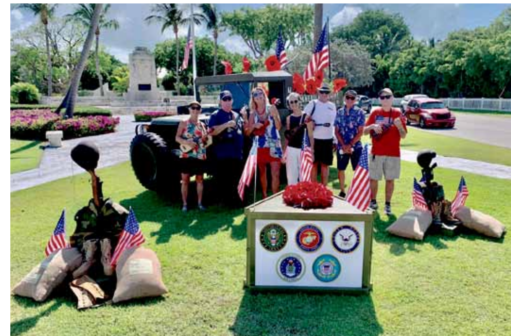
Ukulele JOY entertained at American Legion Poppy Day in Islamorada.