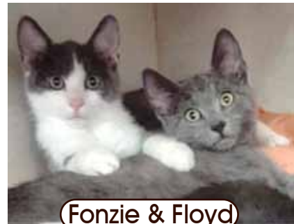
Fonzie & Floyd