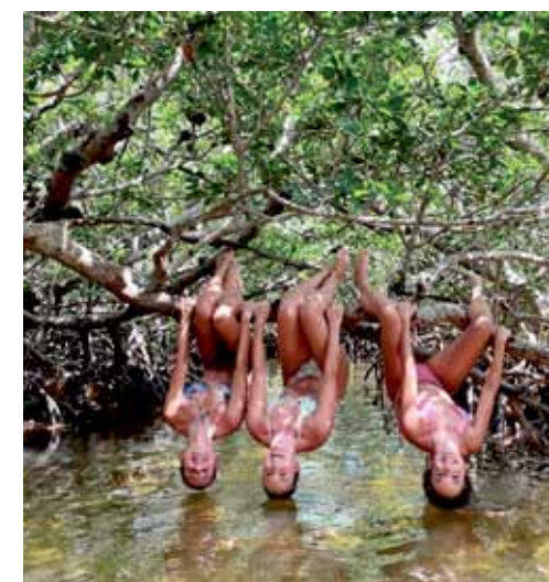
Hanging out in the mangroves