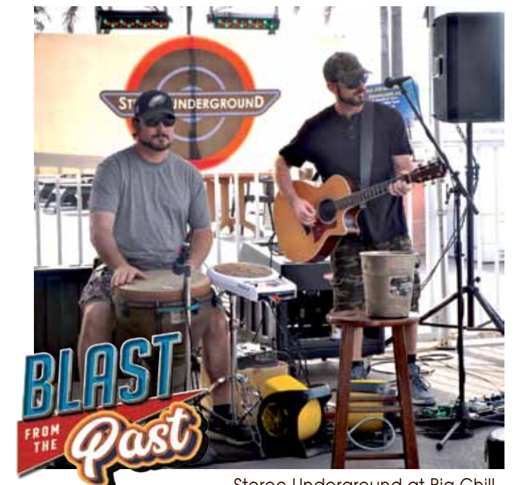
Stereo Underground at Big Chill.