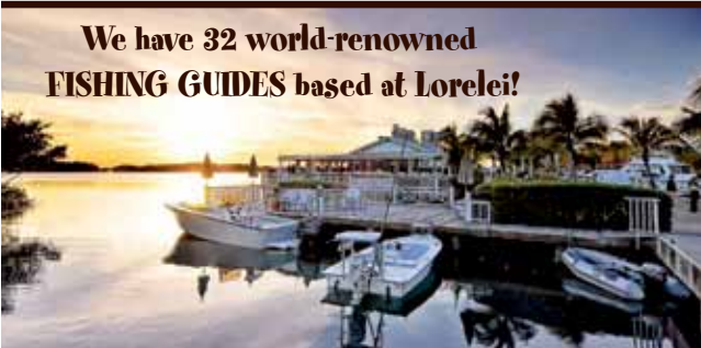
We have 32 world-renowned FISHING GUIDES based at Lorelei!