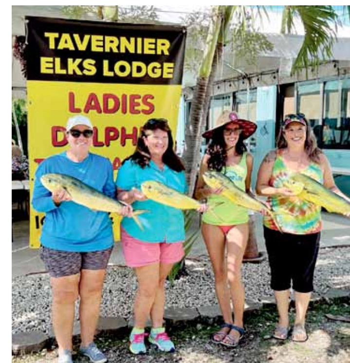
Another successful Elks' Ladies Dolphin Tournament!