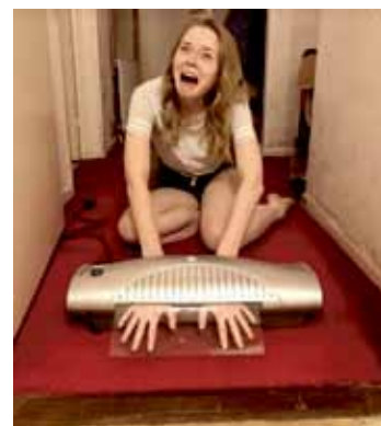
Desktop Laminator $50 OBO 305-555-OUCH