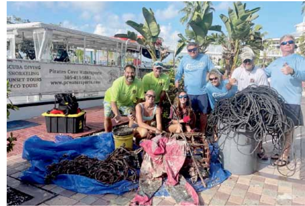
Pirates Cove watersports cleanup crew. Thanks, guys!