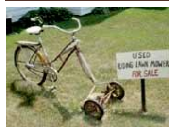
Riding Lawnmower Low Gas Consumption! 305-555-LAWN

Amateur & seasoned musicians wanted! The Keys Community Concert Band begins rehearsals in the fall. More info call 305-451-4530.