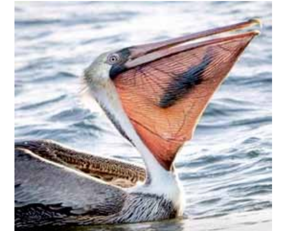
Found on Facebook.