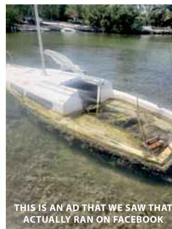
THIS IS AN AD THAT WE SAW THAT ACTUALLY RAN ON FACEBOOK

1976 Sailboat For Sale. She's a good boat holds water really well comes with a Honda generator might need some cleaning.