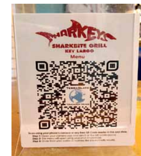
View Sharkey's Menu.