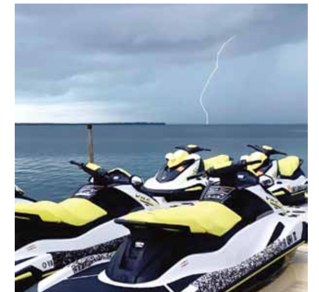
Pirates Cove Watersports - It never rains for long in the Keys..