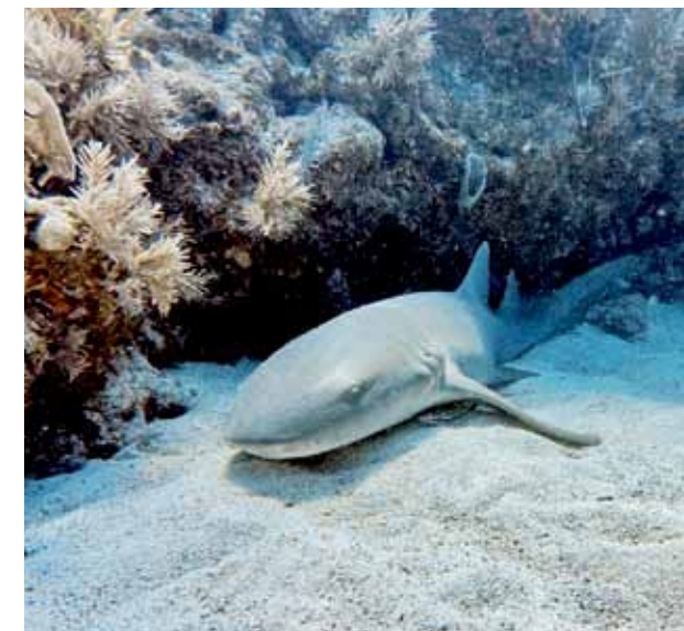
Molasses Reef by Pirates Cove Watersports.