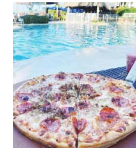
Big Chill and Enrico's Pizza a perfect combination!