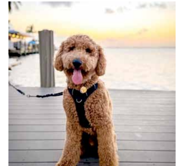
Furry friends are always welcome at the Big Chill.