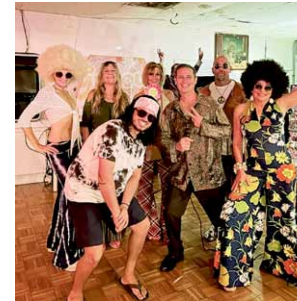
Party night at the Key Largo Moose.