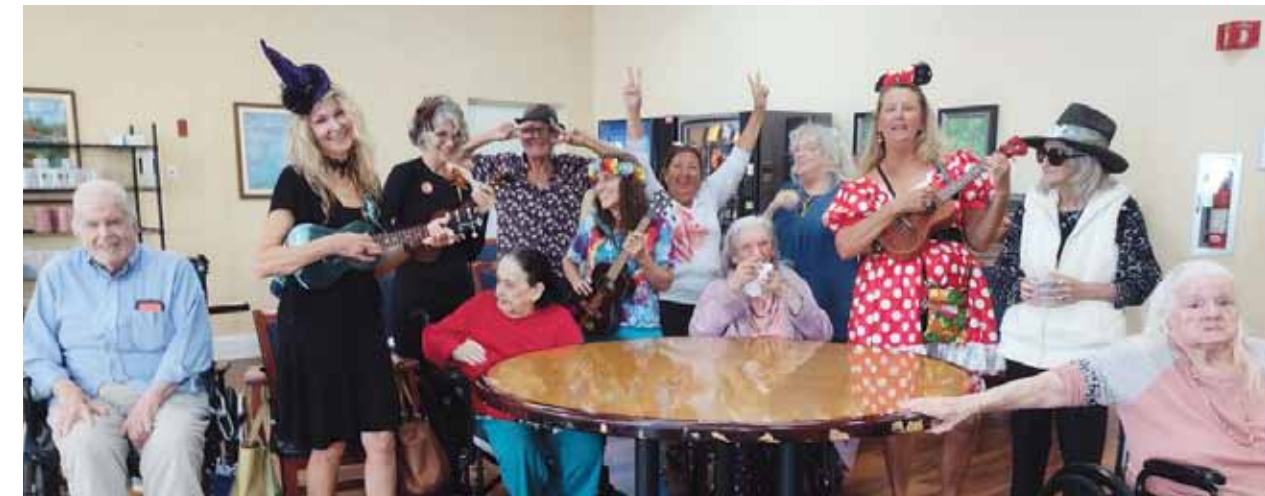
Ukulele JOY, of the JOY Center, performed Halloween songs for Crystal Health and Rehabilitation Center.