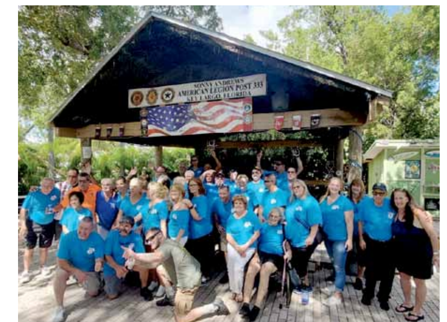
American Legion Post 321 Cooper City supporting Post 333 Key Largo.