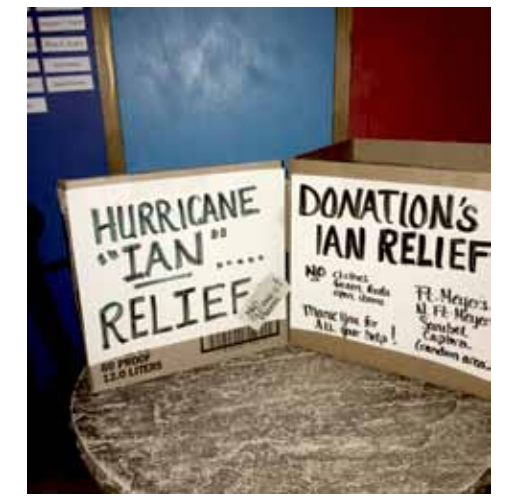
The American Legion is collecting donations for Hurricane Ian victims. No clothing, please!