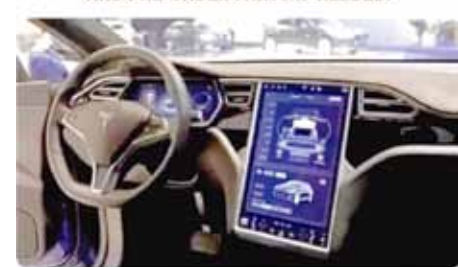
IMAGINE CHECKING YOUR BANK ACCOUNT TO FIND OUT YOUR CAR ORDERED ITSELF NEW TIRES, A PAINT JOB, AND IS PAYING CHILD SUPPORT TO A CHEVY VOLT.

TESLA CARS CAN NOW DIAGNOSE THEMSELVES AND PRE-ORDER PARTS IF NEEDED.