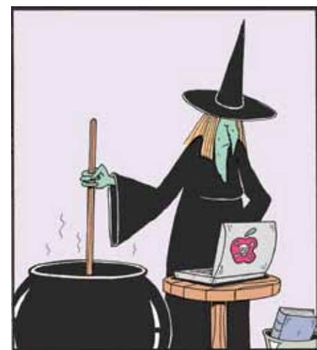
The book of evil spells became a thing of the past with the advent of Wickedpedia.

TESLA CARS CAN NOW DIAGNOSE THEMSELVES AND PRE-ORDER PARTS IF NEEDED.