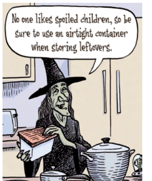
Elliott Gregory @ElliottNGregory

So I'm at Walmart returning 37 pool noodles (because youth ministry) & rather than explaining the whole story of why I'm a grown man returning 37 pool noodles; when asked "Reason for return?" I just said: "The shopping list said noodles, but not what kind...boy was my wife mad."