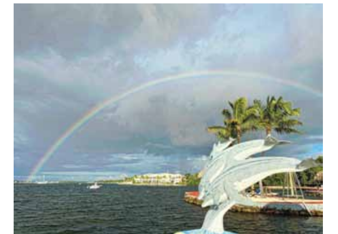
Somewhere over the rainbow on Blackwater Sound.