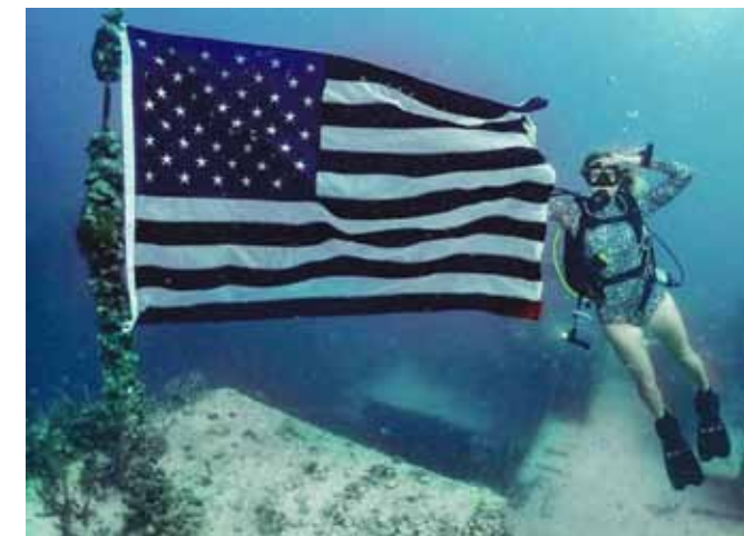
We salute Pirates Cove Watersports.