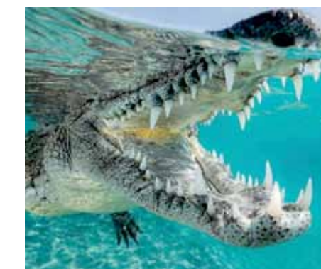
Annual reminder to get your teeth checked!