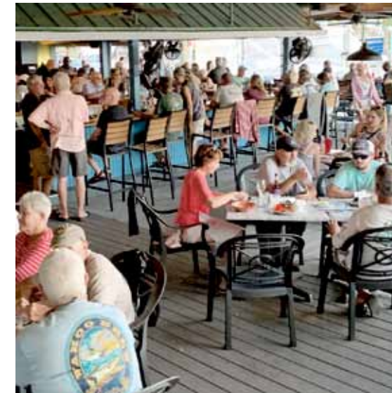
Pilot House- Locals' hangout with stellar food and a great happy hour!