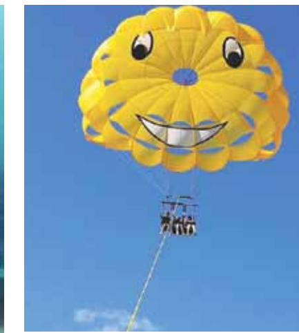
Pirates Cove Watersports in action!