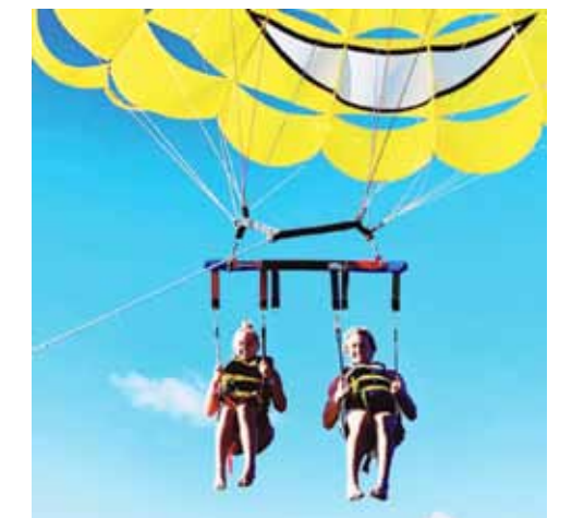
Enjoying the view with Pirates Cove Watersports.