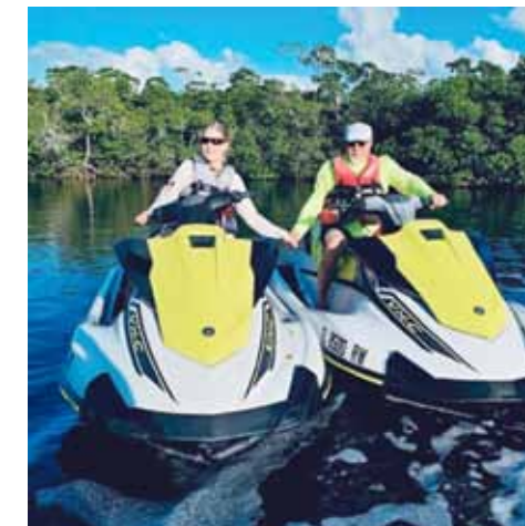
Enjoying the water with Pirates Cove Watersports.