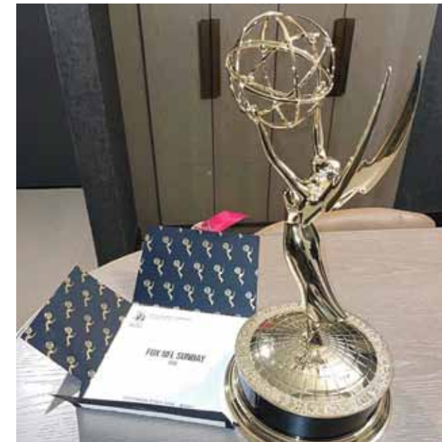
Congrats to Coach Jimmy Johnson & The Fox NFL Sunday Crew for their hard earned Emmy Award.