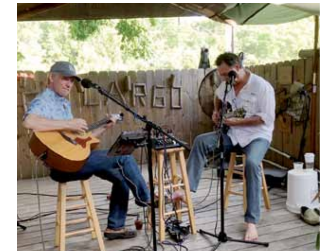
More music at the Moose!