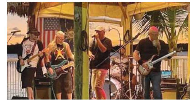
RearViewMirror at the Lorelei.